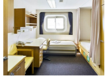
Twin Cabin - Private Facilities 1 sofa bed, 1 lower berth, writing desk, window