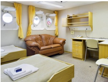
Superior Cabin 2 lower berths, writing desk, porthole