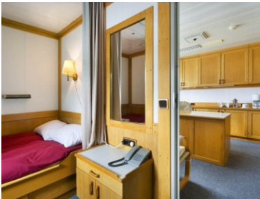
Cook Suite 1 double berth in a separate sleeping area, 1 sofa bed, private facilities with bathtub, desk/chair, TV/DVD, windows