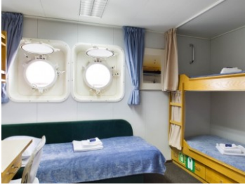
Triple Cabin - Shared Facilities 1 upper and 1 lower berth, sofa bed, washbasin in the cabin writing desk and porthole