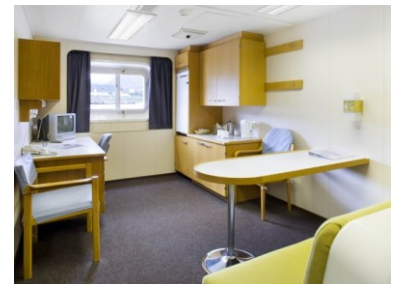
Suite 1 double berth in a separate sleeping area, windows, 1 sofa bed, private facilities with bathtub, desk/chair, TV/DVD